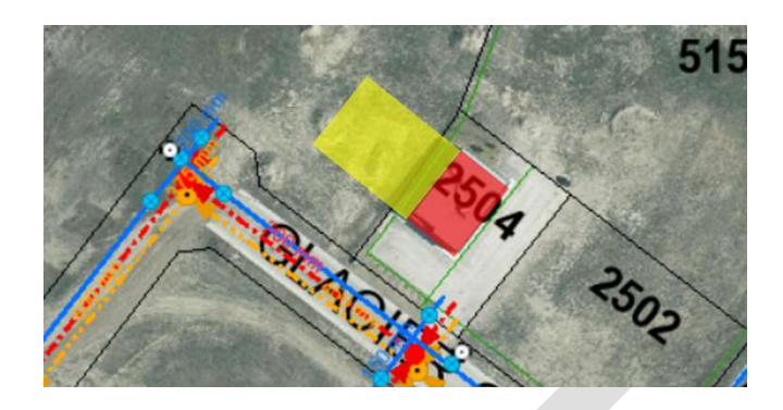
IST INFRASTRUCTURE ($115,000)

The City of Cold Lake will be looking at renovation and expansion opportunities for the CL Medical Clinic