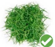
GRASS CLIPPINGS, SOD AND SOIL (carts have a 60 kg (130 lbs.) weight limit.)