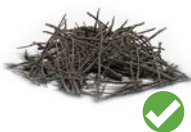
BRANCHES AND TREE TRIMMINGS