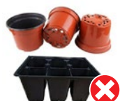
PLANT POTS OR BEDDING TRAYS (recycle the containers, then compost plants and soil)