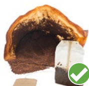
COFFEE FILTERS AND TEA BAGS