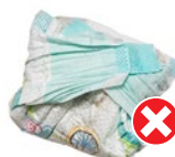
DIAPERS OR WIPES (even if they say compostable)