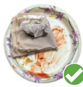
PAPER PLATES, PAPER TOWEL, NAPKINS AND TISSUES