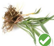
PLANTS, WEEDS AND LEAVES (no noxious weeds)