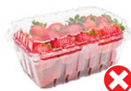
FOAM, PLASTIC OR TIN FOOD PACKAGING (recycle plastic and tin, then compost food scraps)

DO NOT PUT THESE ITEMS IN YOUR GREEN CART.