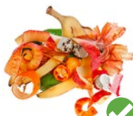
FRUIT AND VEGETABLE PEELINGS (remove stickers), EGG SHELLS AND FOOD SCRAPS

PUT THESE ORGANIC MATERIALS IN YOUR GREEN CART.