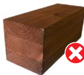
PAINTED OR TREATED WOOD